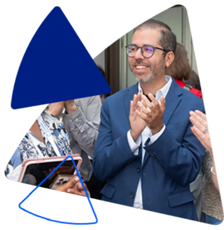
CF Insights returned to the Council in 2023, offering community foundations another method for benchmarking their operations.

Like all communities, philanthropy thrives most when it has a shared baseline of information, values, and goals. To that end, the Council brought CF Insights back into its portfolio so community foundations across the country can compare their organizational sustainability and