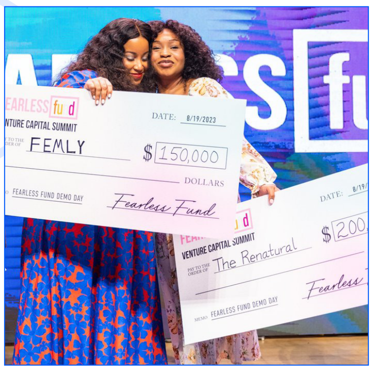
Fearless Foundation is the target of a lawsuit alleging discrimination in its grant programs for Black women-owned businesses. The Council and Independent Sector filed an amicus brief supporting the foundation.

throughout the year. Know that, whatever 2024 may bring, we will remain firmly focused on what we've done every day for 75 years: Work to strengthen philanthropy and the nonprofit sector. With the guidance of our membership and the dedicated professionals who believe in the impact our sector can make, we will continue the work of bridging differences and building common ground to advance the greater good in 2024 and beyond.