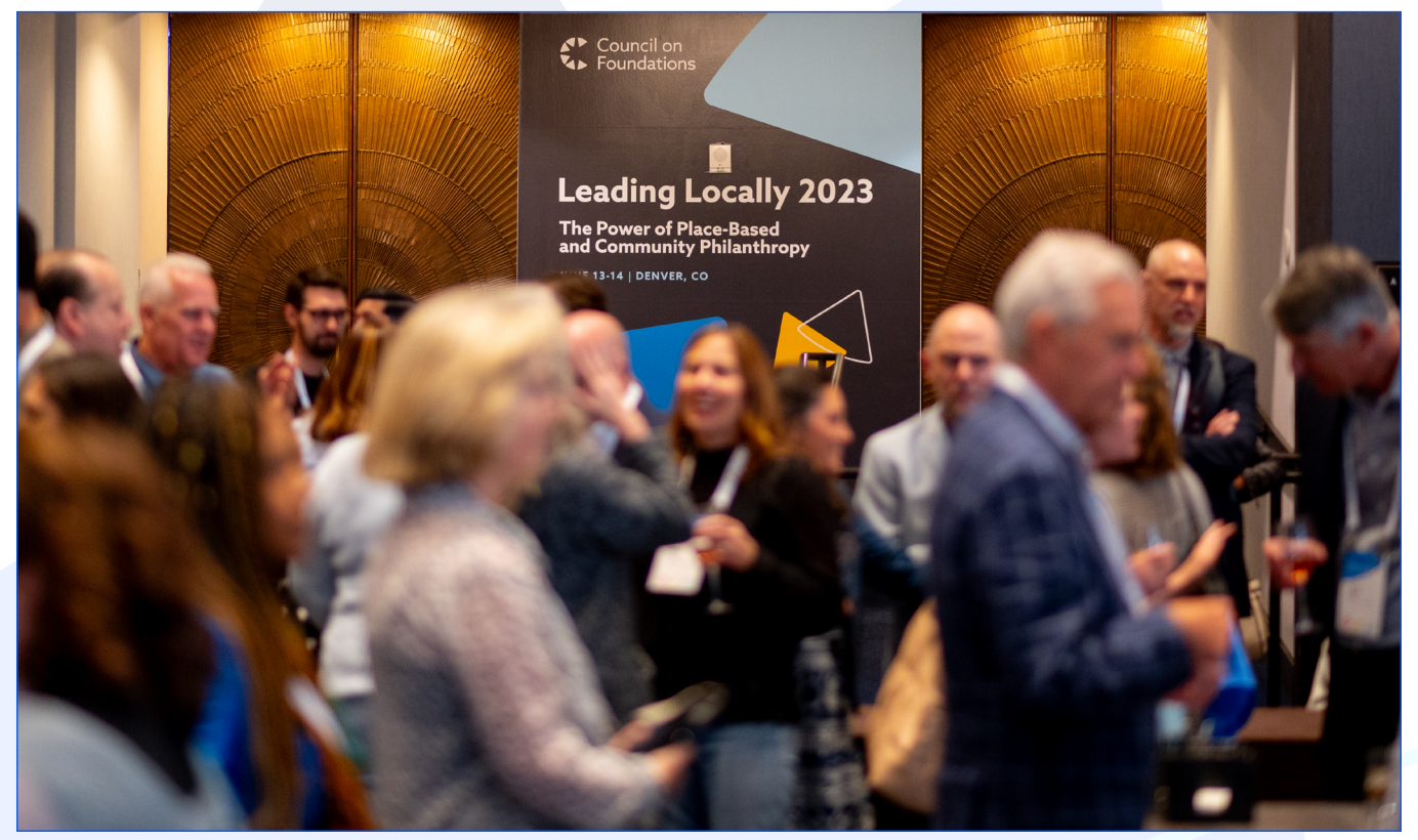
Leading Locally, held in Denver in June, drew 800 attendees to the Council's first in-person conference since the pandemic.

Finally, with our members ever committed to humanitarian needs in communities across the globe,