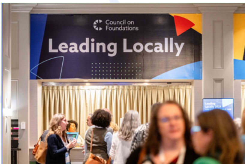
Leading Locally 2025 brought more than 1,000 community- and place-based funders to Minneapolis-St. Paul in June to share resources and strategies.

garnered 31 million impressions across digital TV, podcasts, social media, and news sites.