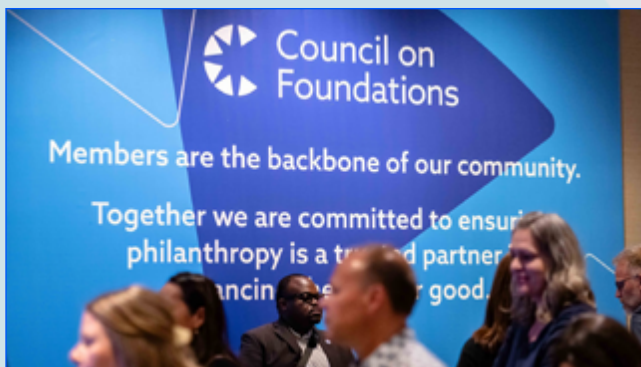
Council members at Leading Locally 2025 in June.

In 2025, the Council surpassed a major milestone — over 1,000 members ! More than 200 new organizations joined the Council in just the last year, growing our member community to 1,006 in total and helping to strengthen our efforts on behalf of philanthropy at a pivotal moment for the sector.