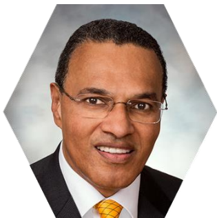
Freeman Hrabowski UMBC