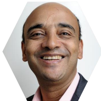
Anthony Appiah New York University