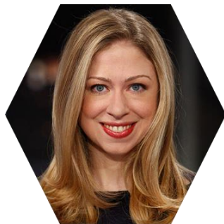
Chelsea Clinton Clinton Foundation