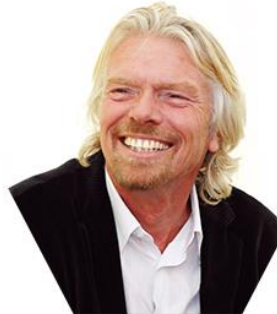
Sir Richard Branson Virgin