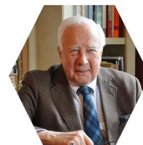
David McCullough Author